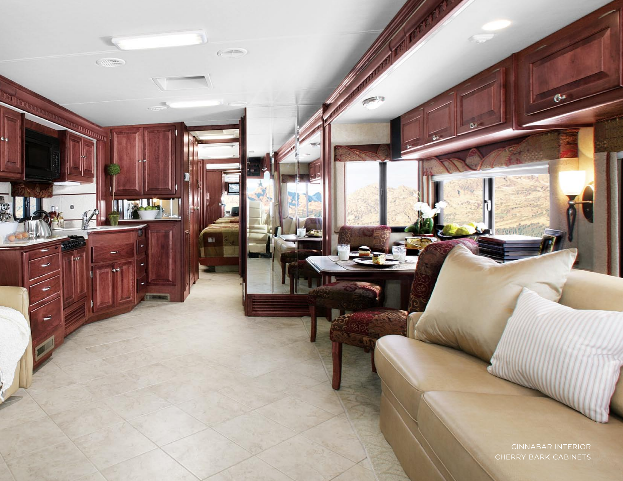
CINNABAR INTERIOR CHERRY BARK CABINETS