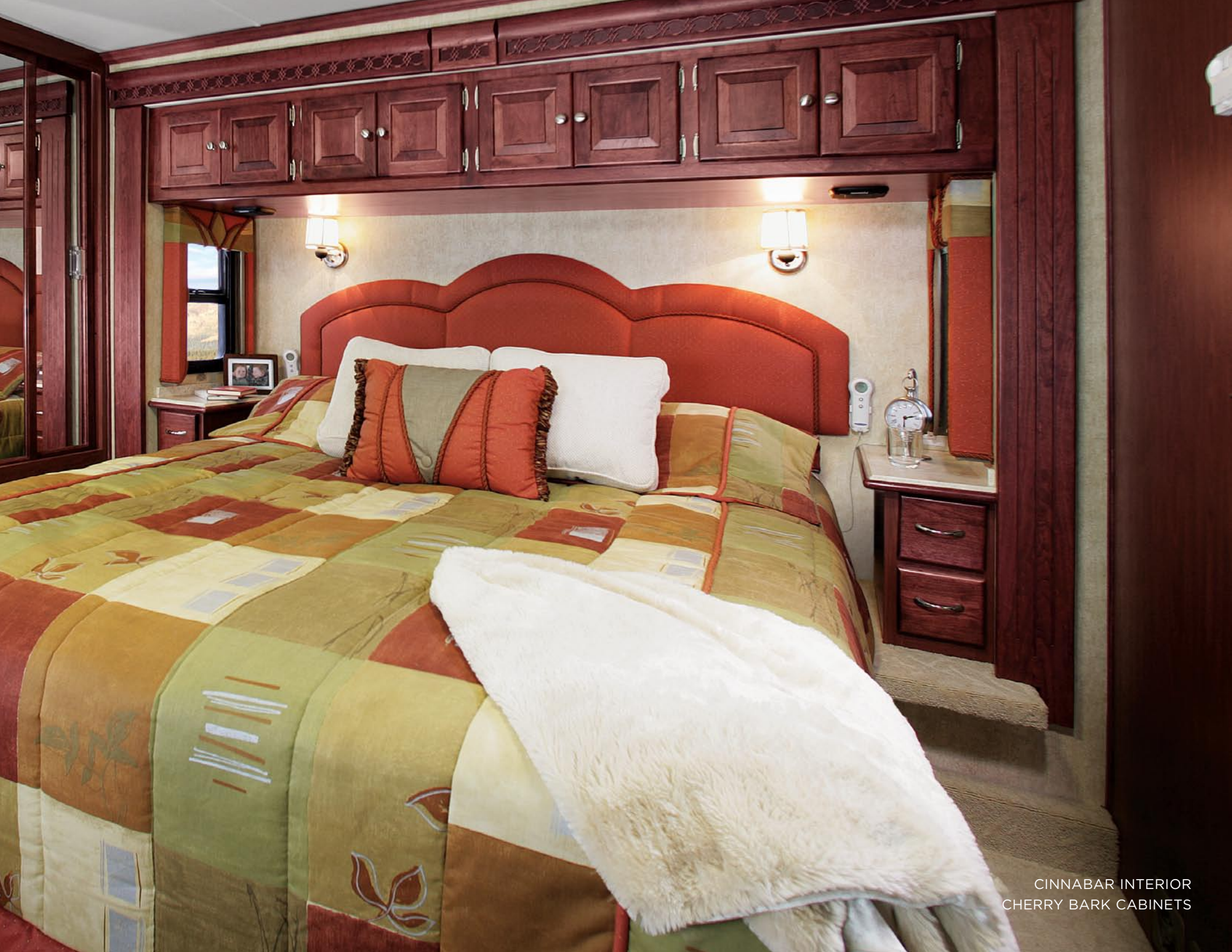
CINNABAR INTERIOR CHERRY BARK CABINETS